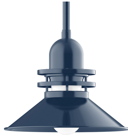
Shown in navy / clear

The Atomic Outdoor Rings Stem Pendant brings a traditional 1920's industrial look to your exterior space. The vintage perforated dome shade, with two rings around the top, surrounds a glass jar diffuser, casting warm light around your area. The polyester powder coat finish provides color retention and scratch resistance. Note: All options offered have clear glass, but all images are shown with frost glass. No images available for clear glass.