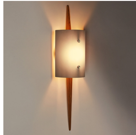
Shown in white oak / cased smoke

Like guiding points on a compass, the Laddi Cylinder Wall Sconce features a distinct yet referential form. This piece gracefully balances white oak or polished unlacquered brass with a luminous smoked glass shade in a sleek silhouette. Note: The brass accents are unlacquered; with use they will darken and patina over time. Polishing will restore the sheen if desired.