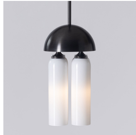
Shown in dark oxidized / white

The Crown Pendant features a quartet of handblown glass cylinders capped by a metal dome. The tops of the glass cylinders curve to echo the dome shape, creating a harmoniously symmetrical silhouette. Crown's geometric design will complement a wide variety of decor styles.