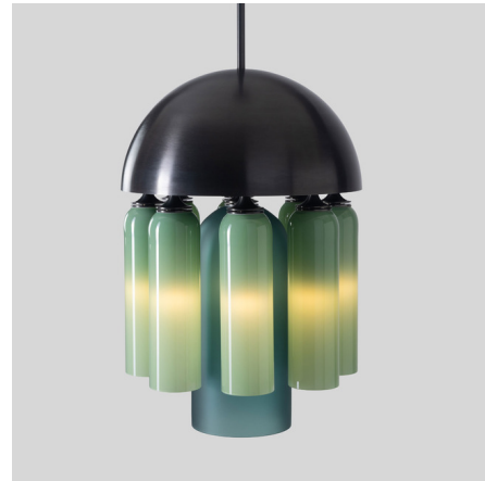
Shown in dark oxidized / pastel green / pine tree green

COLOR RENDERING . . . . . 90 CRI LAMP COLOR . . . . . 2700K LUMENS/WATT . . . . . 514.29 LUMINOUS FLUX . . . . . 3600 lumens