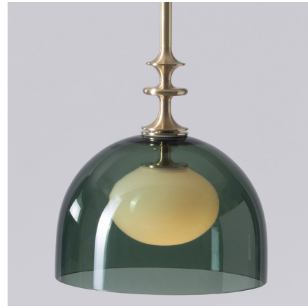
Shown in brushed brass / white / smoke

The Elizabeth I Pendant combines glass shapes of different shapes and opacities to create an understated and elegant fixture that will complement a wide variety of decor styles. Elizabeth's transparent glass dome surrounds an opaque ellipsoid which houses the light bulb. The pendant's stem gracefully transitions into a decorative metal profile, which provides an understated accent.