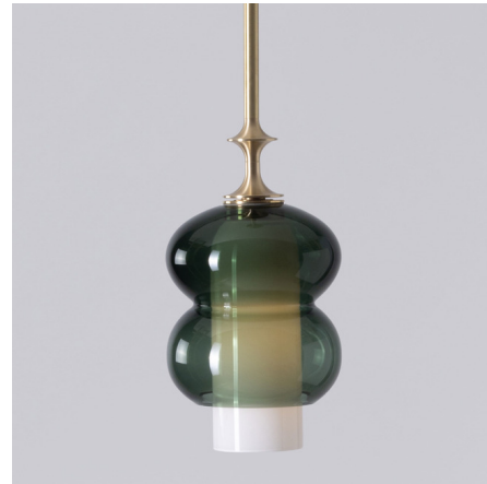
Shown in brushed brass / white / smoke

The Prince Pendant features a handblown, transparent glass shade with a double ellipsoid shape surrounding an opaque glass cylinder. Above the glass, the pendant's stem transitions into an organically curving, decorative profile which adds an elegant accent to the design. Prince's use of overlapping shapes and opacities offers a sophisticated aesthetic rich with subtle details.