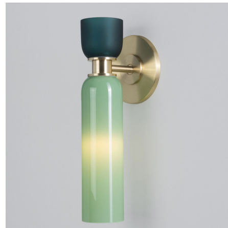
Shown in brushed brass / pastel green / pine tree green

The Union Wall Sconce combines upward and downward-facing glass domes in a variety of proportions, color palettes, transparencies, and textures for an elegant and sophisticated look. The lower glass portion is made of glossy opaque glass and illuminated from within to produce an ethereal glow. The upper glass dome is made of frosted glass, and the two pieces are separated by a brass arm with classic detailing.