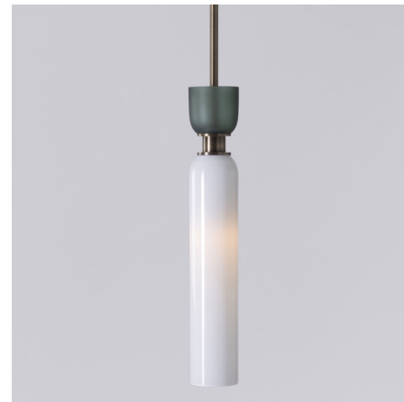
Shown in antique brass / white / smoke

The Union Pendant combines upward and downward-facing glass domes in a variety of proportions, color palettes, transparencies, and textures for an elegant and sophisticated look. The lower glass portion is made of glossy opaque glass and illuminated from within to produce an ethereal glow. The upper glass dome is made of frosted glass, and the two pieces are separated by a brass band. The larger size also features a transparent dome surrounding the lower portion of the pendant, adding another layer of color and form to the design.