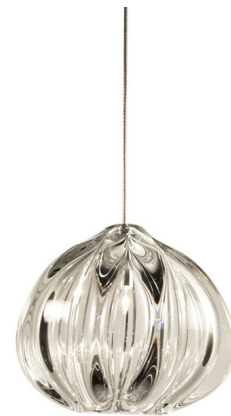
Shown in satin nickel / clear

PRODUCT DIMENSIONS . . . . . Adjustable Cable Length: 72"