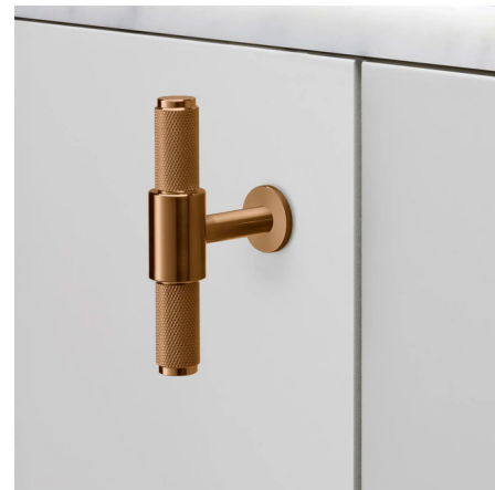
Shown in warm sunset

Buster + Punch's T-Bar Drawer Pull is refined by hand and features their signature diamond-cut, cross-knurl pattern. This handle will elevate the aesthetics of cabinet doors, cupboards, or just about anything that can open. Note: T-Bar is fitted from behind cabinet door and can not be frontface fitted.