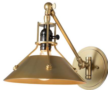
Shown in modern brass / modern brass

The Henry Swing Arm Wall Sconce brings both style and function to your interior space. The open diffuser adds warm light in your room while the adjustable arm, with a steel claw, brings a classic industrial vibe to your room. Choose a Finish for the base, pipe, and socket and a Color for the shade. Thumb screws on the sconce arm allow for vertical height adjustment while a swivel at the baseplate allow for side to side adjustment of 25 degrees in each direction. Dimmer switch is located on the socket. Limited lifetime warranty when installed in a residential setting. Handcrafted to order by skilled artisans in Vermont, USA.