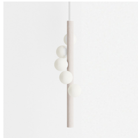
Shown in white oak / white

The Willow Vertical Pendant brings a chic and intriguing design that draws inspiration from nature to your interior space. The wooden branch holds hand blown glass globes, like spring buds nestled in, waiting to fully bloom. Canopy: 7 inch diameter.