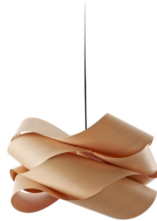
Shown in white / natural beech

The Link Suspension appears exceptionally dashing in its stacked wood veneer Mobius strips. In mathematics, the Mobius strip is a surface with one continuous side, meaning the Link light is not only handsome, but discerning too. With its billowy, cloud-like structure, Link is decidedly easy on the eye. Punctiliously crafted, the lamp's floating form is a clever illustration of wood's significant potential in lighting design. Canopy: 4.5 inch diameter CANOPY & CABLE FINISHESWH - Matte White / White Cable