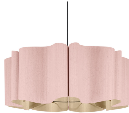
Shown in black / rose / ash