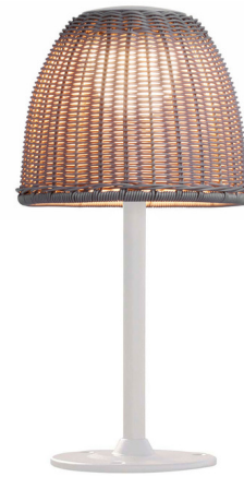
Shown in natural white / light beige

COLOR RENDERING . . . . . 90 CRI LAMP COLOR . . . . . 2700K LUMENS/WATT . . . . . 133.57 LUMINOUS FLUX . . . . . 1122 lumens