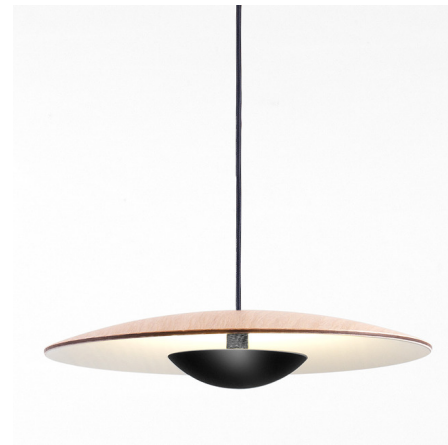
Shown in matte black / oak / white interior

COLOR RENDERING . . . . . 90 CRI LAMP COLOR . . . . . 2700K LUMENS/WATT . . . . . 25.00 LUMINOUS FLUX . . . . . 350 lumens