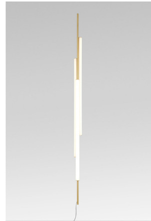
Shown in black / frost