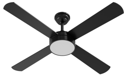
Shown in black / frosted

LAMP LIFE . . . . . 50000 hours COLOR RENDERING . . . . . 90 CRI LAMP COLOR . . . . . CCT Select LUMENS/WATT . . . . . 70.00 LUMINOUS FLUX . . . . . 1400 lumens