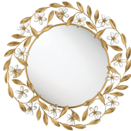
Shown in antique gold

The Marselle Mirror is adorned with hand-cut crystal jewels and wrought iron leaves designed in a playful arrangement. The detail of leaves and intricate floral designs lend a sense of organic artistry to each piece, creating a mesmerizing display of nature's splendor. The crystal jewels are cleverly connected to form delicate flowers, adding a touch of whimsy and charm to your space. Even the canopy features a leafy design, completing the harmonious blend of nature and art.