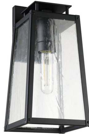
Shown in matte black / clear antique glass

Interchangeable socket covers add another layer of versatility, allowing for easy customization. The result is a quietly enduring design that brings effortless harmony to both traditional and contemporary architecture.