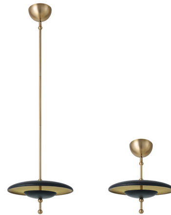
Shown in champagne gold / black

PRODUCT DIMENSIONS . . . . . Rods Included: 3"(2), 6"(2), 12"(3) LAMP LIFE . . . . . 25000 hours LAMP COLOR . . . . . CCT Select LUMENS/WATT . . . . . 11.90 LUMINOUS FLUX . . . . . 119 lumens