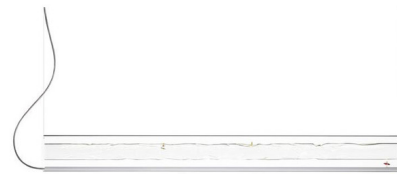
Shown in aluminum / clear

COLOR RENDERING . . . . . 90 CRI LAMP COLOR . . . . . 2700K LUMENS/WATT . . . . . 179.63 LUMINOUS FLUX . . . . . 4850 lumens