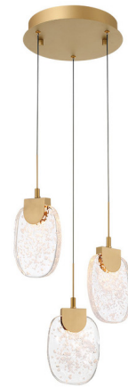
Shown in painted antique brass / clear

LAMP LIFE . . . . . 20000 hours COLOR RENDERING . . . . . 90 CRI LAMP COLOR . . . . . 3000K LUMENS/WATT . . . . . 60.00 LUMINOUS FLUX . . . . . 900 lumens