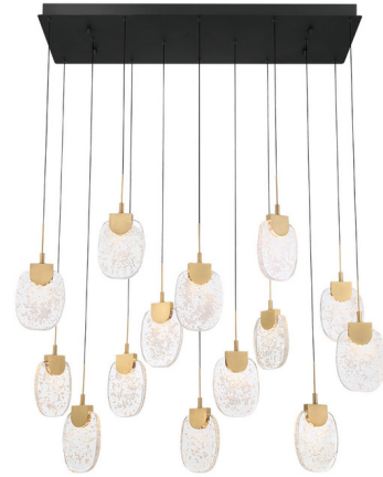
Shown in matte black / clear

LAMP LIFE . . . . . 20000 hours COLOR RENDERING . . . . . 90 CRI LAMP COLOR . . . . . 3000K LUMENS/WATT . . . . . 60.00 LUMINOUS FLUX . . . . . 4200 lumens