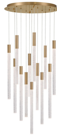
Shown in brushed brass / clear

LAMP LIFE . . . . . 20000 hours COLOR RENDERING . . . . . 90 CRI LAMP COLOR . . . . . 3000K LUMENS/WATT . . . . . 38.46 LUMINOUS FLUX . . . . . 1500 lumens