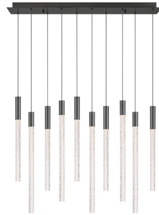
Shown in gun metal / clear

LAMP LIFE . . . . . 20000 hours COLOR RENDERING . . . . . 90 CRI LAMP COLOR . . . . . 3000K LUMENS/WATT . . . . . 39.33 LUMINOUS FLUX . . . . . 1180 lumens