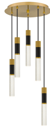
Shown in brushed gold / matte black / clear seedy