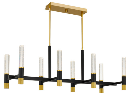
Shown in brushed gold / matte black / clear seedy