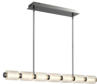
Shown in black chrome / clear ribbed