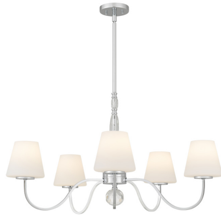
Shown in polished chrome / opal etched

Graceful curves, gleaming polished chrome, and soft, glowing shades define the romantic charm of the Stone Chandelier. The classic chandelier features opal etched glass. Chandeliers include a dual mounting system, choose a clean, rod-to-canopy look or opt for the chain-loop-chain for easier installation. Timeless, luminous, and versatile, Stone brings classic beauty to any space.