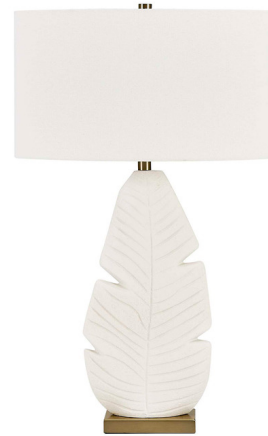
Shown in white / brass / white

COLOR . . . . . White BODY FINISH . . . . . White / Brass WATTAGE . . . . . 27W DIMMER . . . . . Included DIMENSIONS . . . . . 19"W x 31.25"H x 19"D BULB NOT INCLUDED . . . . . 1 x A21 3-Way/Medium (E26)/27W/120V LED COUNTRY OF ORIGIN . . . . . Viet Nam