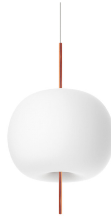
Shown in copper / opal

The Kushi Pendant offers a playful design with a modern edge, featuring a diffuser composed of two layers of blown Opal glass with a Copper accent rod piercing through to create a silhouette reminiscent of a candied apple.