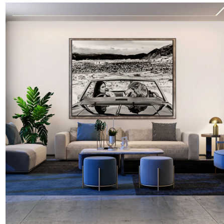
Shown in satin aluminum