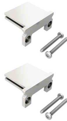
Shown in satin aluminum

End caps are sold in a pair and provide a finished look at the end of a run as well as hold the required power connector. Designed for use with PureEdge Light Channel DIY 0.3 inch Surface Mount.