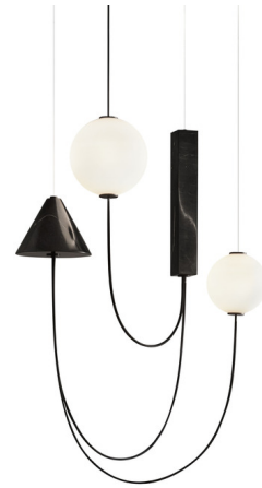
Shown in black marble / matte white

COLOR RENDERING . . . . . 90 CRI LAMP COLOR . . . . . 2700K LUMENS/WATT . . . . . 114.07 LUMINOUS FLUX . . . . . 3000 lumens