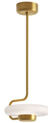
Shown in brass / opal