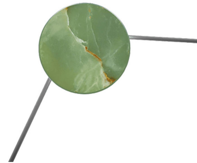
Shown in green onyx

COLOR RENDERING . . . . . 90 CRI LAMP COLOR . . . . . 2700K LUMENS/WATT . . . . . 107.14 LUMINOUS FLUX . . . . . 450 lumens