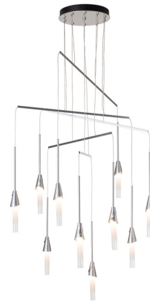
Shown in sterling / frost / clear

PRODUCT DIMENSIONS . . . . . Min/Max Adjustable Overall Height: 25" - 70"