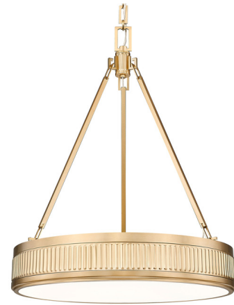
Shown in modern gold / white

COLOR RENDERING . . . . . 90 CRI LAMP COLOR . . . . . CCT Select LUMENS/WATT . . . . . 722.50 LUMINOUS FLUX . . . . . 17340 lumens