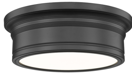
Shown in matte black / white

COLOR RENDERING . . . . . 90 CRI LAMP COLOR . . . . . CCT Select LUMENS/WATT . . . . . 40.42 LUMINOUS FLUX . . . . . 970 lumens