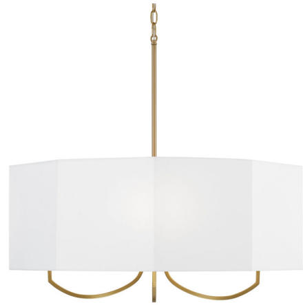
Shown in aged brass / white

PRODUCT DIMENSIONS . . . . . Rods Included: 6"(1), 12"(1), 18"(1)