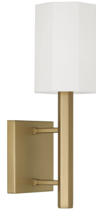
Shown in aged brass / white

Defined by its geometric form, the Adrian Wall Sconce offers a tailored silhouette with a sophisticated edge. The white octagonal fabric shade and faceted candle detail introduce layered dimension, creating a balanced blend of texture and structure.