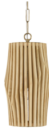
Shown in matte brass / blonde wood / blonde wood

Featuring elongated vertical lines, the sculptural style of the Archer Pendant is stunning from every angle. Artisan-crafted slats of mango wood create the sensation of motion in a visually intriguing wave grounded by a Matte Black metal frame.