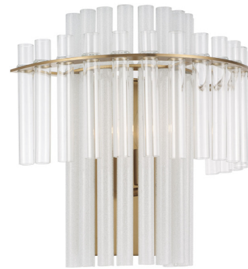
Shown in aged brass / clear

The Blair Sconce creates a striking visual effect through its layered arrangement of glass elements. Elongated etched glass tubes form an inner arc, framed by a surrounding band of shorter clear tubes, producing depth and texture. This thoughtful construction diffuses light beautifully, casting a soft, radiant glow while adding dimension and movement to the fixture's overall form.