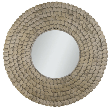
Shown in grecian-luster

Hand-applied metal discs layer across the frame to create rich texture and depth in the Delphine 32.5 inch mirror. Finished in Grecian Pewter, each individual piece reflects light slightly differently, adding dimension and a subtle sense of movement to the round design.