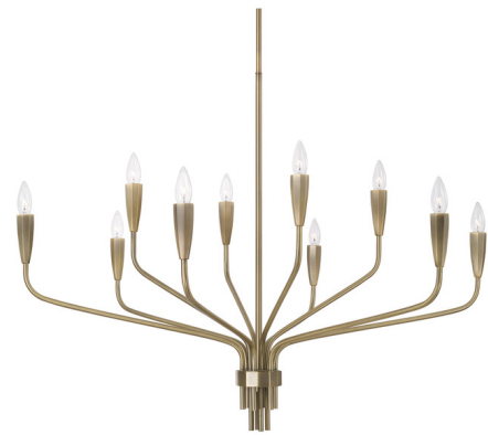
Shown in antique brass