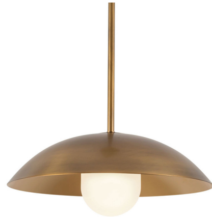
Shown in vintage brass / opal

PRODUCT DIMENSIONS . . . . . Downrod: 3x12", 1x6", 1x4"