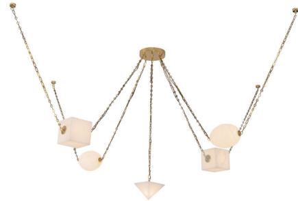
Shown in patina brass / alabaster

LAMP LIFE . . . . . 50000 hours COLOR RENDERING . . . . . 90 CRI LAMP COLOR . . . . . CCT Select LUMENS/WATT . . . . . 83.33 LUMINOUS FLUX . . . . . 6250 lumens