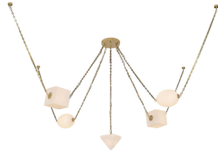
Shown in patina brass / opal