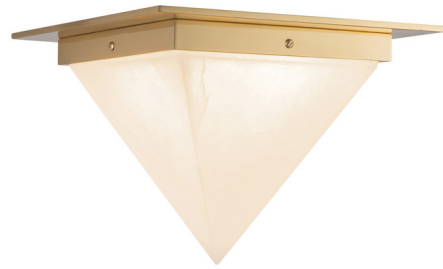
Shown in patina brass / alabaster

Inspired by salt crystals, the Mineral Pyramid Ceiling Light celebrates the elemental beauty of repeating geometric shapes. A sculptural square form is framed by patina brass or urban bronze, and made from either natural alabaster stone or uniquely molded mineral glass. When illuminated, the square diffuses light with a soft, textural glow.